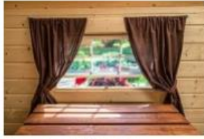
Brown curtains set