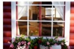
Flower pot for Pavilion and Grill

* Only for Standard 6-corner grill and chimney set