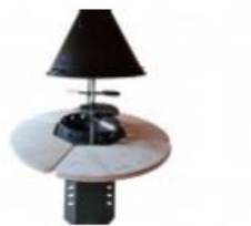
"Viking Premium" Grill and Chimney