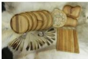
Wooden dishes and flatware set**