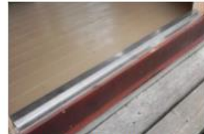
Stainless steel door sill