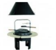
"Viking" Grill and Chimney