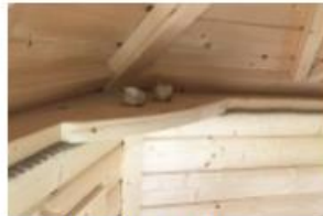
Shelf for Grill cabin