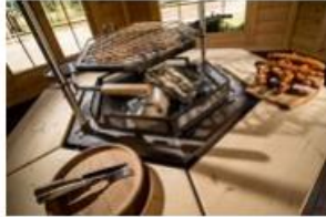
Grill table safety fence*