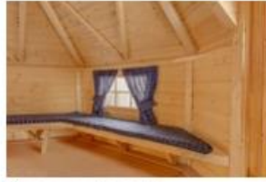
Blue curtains set