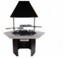
Luxury Grill and Chimney