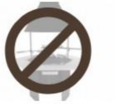
Without Grill and Chimney