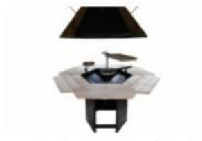
Standard 6-corner Grill and Chimney