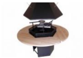
"Premium" 6-corner grill and chimney